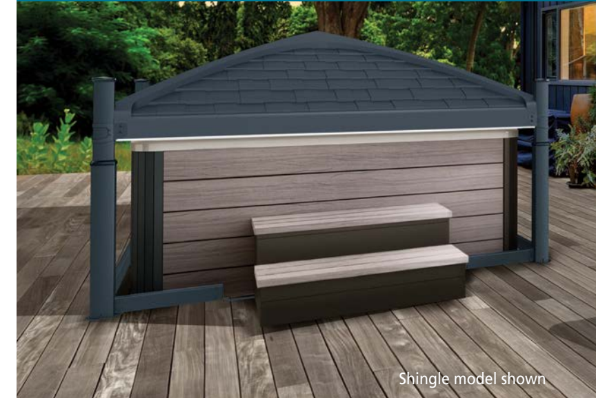
Shingle model shown