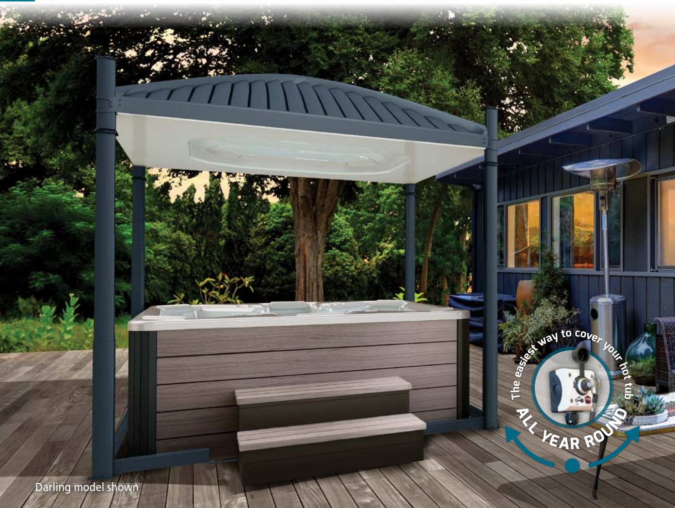
Darling model shown

The easiest way to cover your hot tub ALL YEAR ROUND